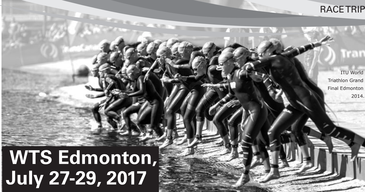
ITU World Triathlon Grand Final Edmonton 2014.