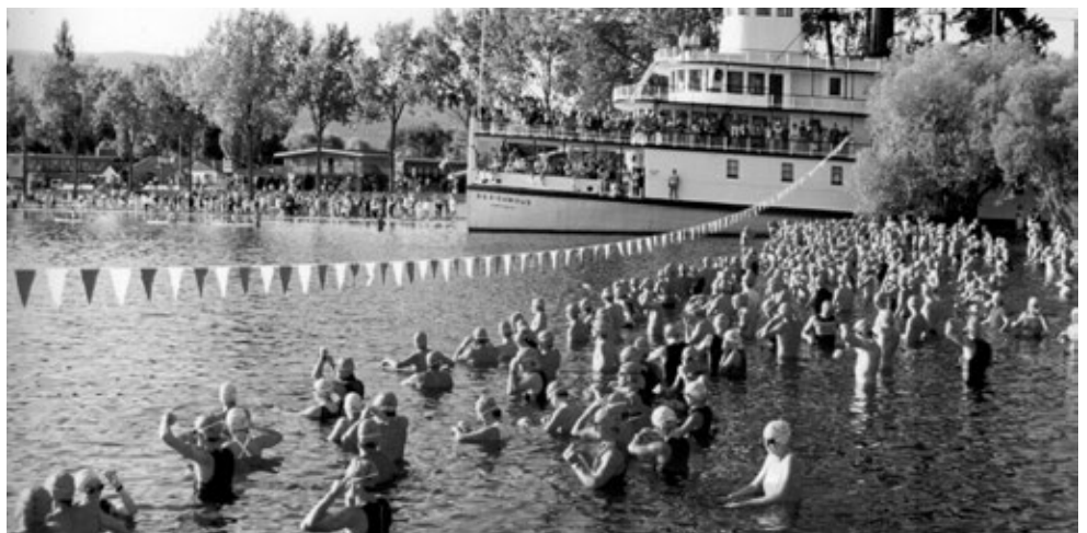
Original start line 35 years ago - it's moved further down the beach to by the Peach now.