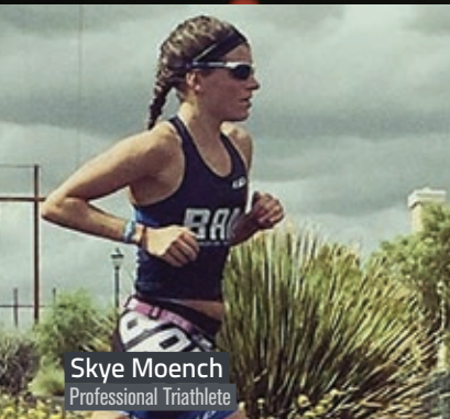
Skye Moench Professional Triathlete