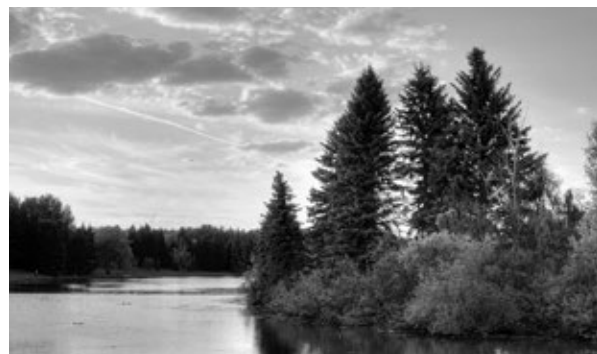
Ring lake in Hawrelak Park, Edmonton

At WTS Edmonton, the wetsuit-friendly swim involves one loop around an island, or two loops if competing in the standard distance. Once you hop on your bike, the course will take you out