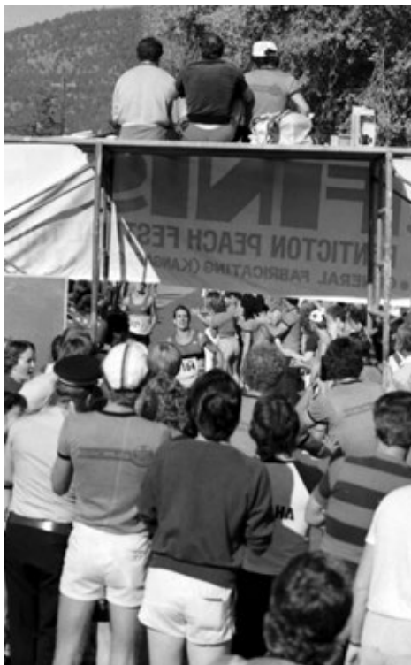
Rugby shorts, anyone? Firm legs look good any and all years, including 1983, showing fit spectators at the Peach Classic finish line grandstands.

Sixty-eight triathletes hit the water and 63 were official finishers. By 11:30