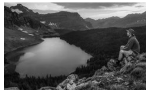
Clockwise from left Art Gallery of Alberta, streetcar at High Level Bridge, and Banff National Park