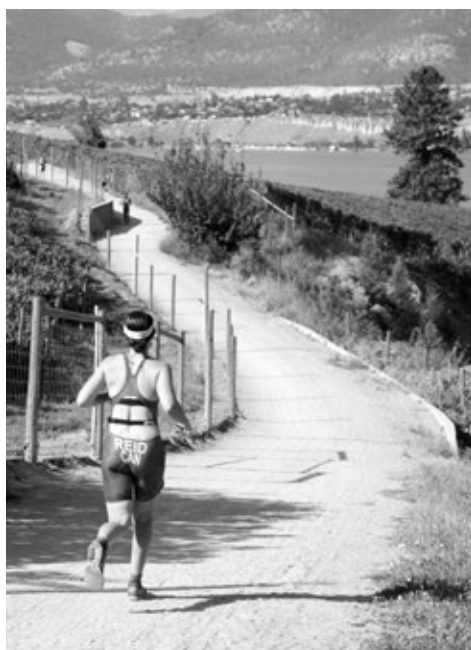
Above: Runner on the Kettle Valley Railway (KVR) heading into downtown Penticton on the Cross Triathlon run course. Cycling photo: Athletes riding along Skaha Lake on Long Distance Triathlon course, half way through 120km.

There is a lot going on with triathlon in BC this year, including the 2017 ITU Multisport World Championships in Penticton, BC. We take a look back at 2016's Multisport Festival and a look forward.