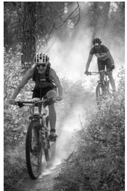
Above: Cross Triathletes on 3 Blind Mice Singletrack half way into Cross Triathlon bike course.

There is so much to do in Penticton. You'll want to check out the races, but be sure to check out the local wineries and breweries, the farmers market, and many of the other cool attractions Penticton has to offer. There's a special page on our website dedicated to tourism and the "what to do" when you're in Penticton.