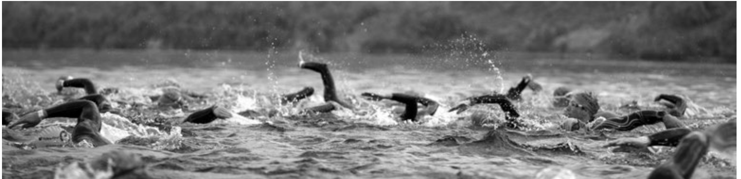
Athletes in the Long Distance Triathlon swim in Lake Okanagan, shown here from 2016.

excite - businesses, athletes and citizens about what's coming up.